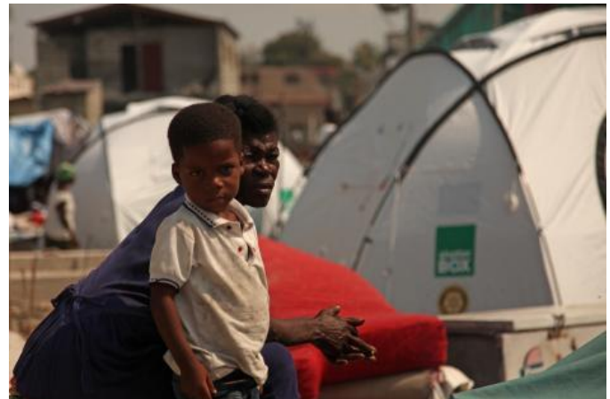
Tents are urgently needed in Haiti before the Caribbean rains begin.

'This picture is replicated throughout Port au Prince and the outlying affected by the quake. There are not enough tents to go round and the consensus is that when the rains come we will have a second emergency on our hands.'