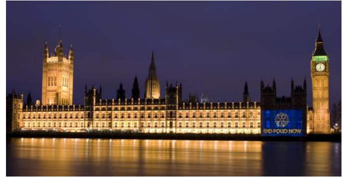
Parliament & Big Ben - London England