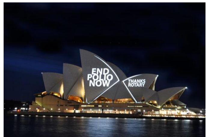
Sydney Opera House - Sydney Australia