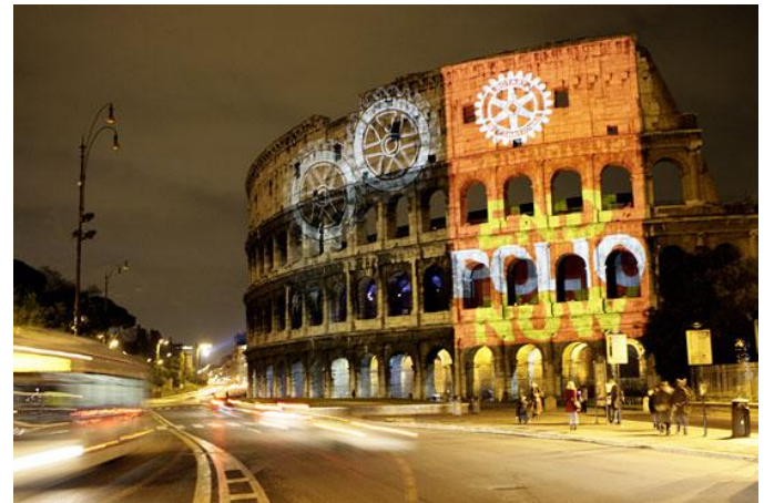
The Roman Coliseum - Rome Italy